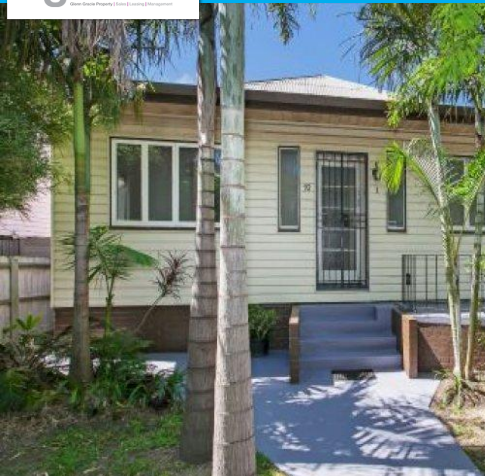
Large three bedroom unit in leafy street